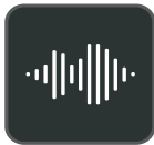
Optima Audio Experience