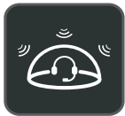
Acoustic Shield Technology

The Yealink WH62 is a new entry-level DECT wireless headset, with WH62 Dual and WH62 Mono two models. Work seamlessly with major UC platforms and integrate natively with Yealink IP phones. Yealink Full-band Audio Technology and Acoustic Shield Technology make you talk and hear clearly during phone calls and enjoy the stereo crystal music experience. With easily on-ear control, interruption free, comfortable wearing, WH62 is a nice partner either for communicating or collaborating.