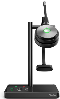
WH62 Mono Teams WH62 Mono UC