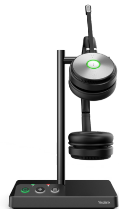
WH62 Dual Teams WH62 Dual UC

Based on hundreds of headform evaluations and thousands of wearing comfort tests, WH62 well meets the ergonomic requirements. Besides, with premier soft leather cushions and lightweight design, you can wear it all day comfortably. For more workspace freedom, WH62 can also free you up to 160m away from the desk.