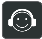
All Day Wearing Comfort